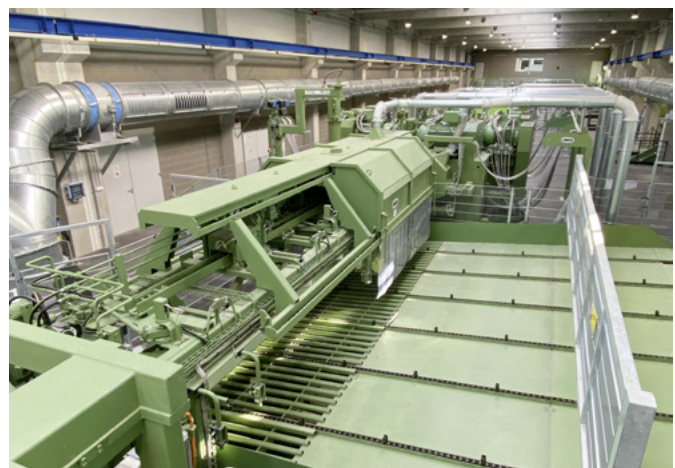
Sideboard separator with dust cover connected to a Scheuch extraction system