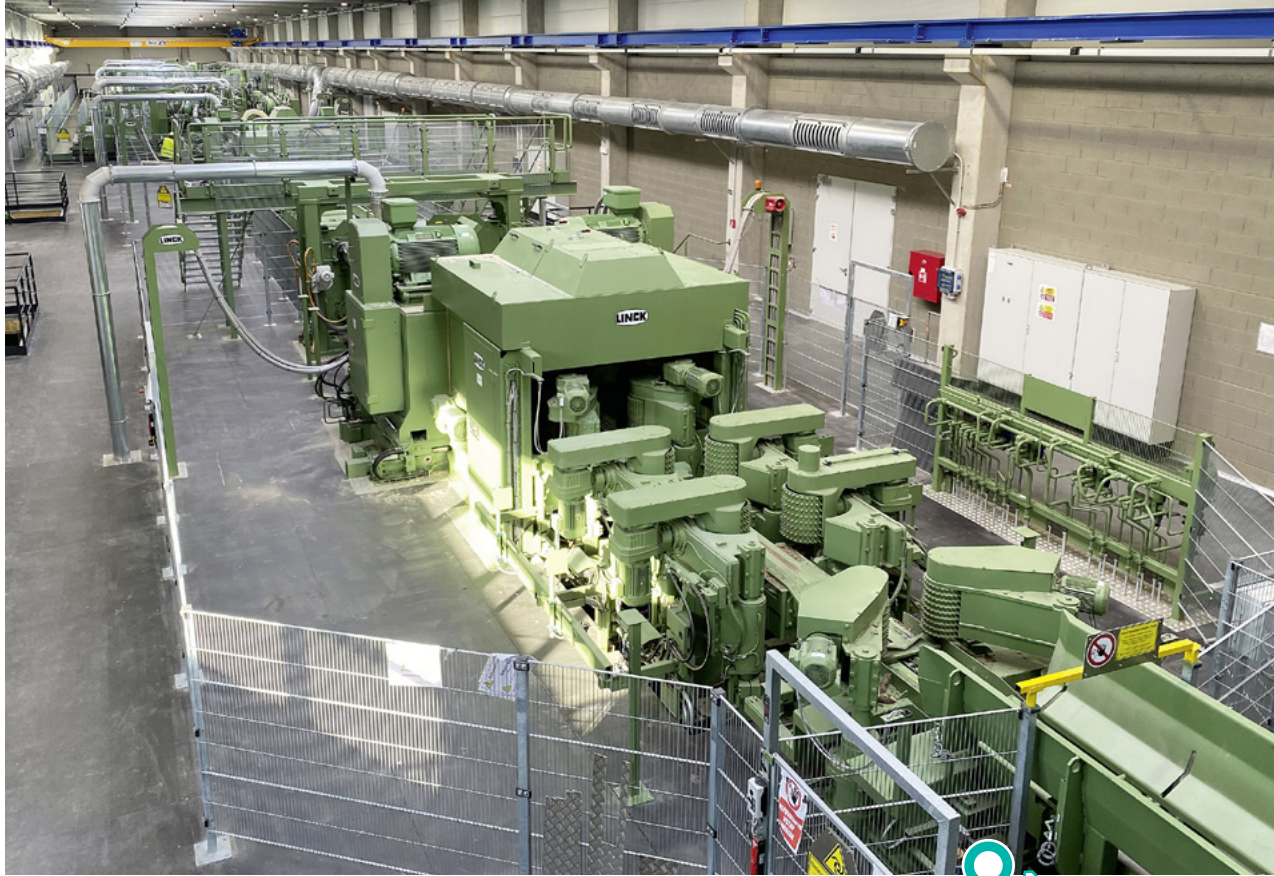
A look into the sawmill hall with the new Linck chipper canter line

This chipper canter's infeed device is equipped with a model optimization which can position the model diagonally for a better yield. Next, another 3D measurement is done. On the basis of the data obtained, sideboards are optimized in their width, position and length. Optimization is not done based on volume but on value by means of a customer-specific database.