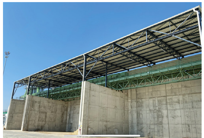
Also provided by Rudnick & Enners: Box loading optimized in terms of demand and fill level with RE-MB conveyor belts