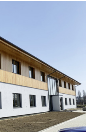
Labe Wood's new office building in Steti