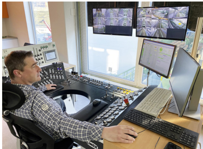
Always keeps an eye on supply: The saw line operator sits facing the log infeed