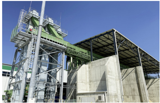
Transport of wood chips and sawdust with RE-GBW bucket elevators