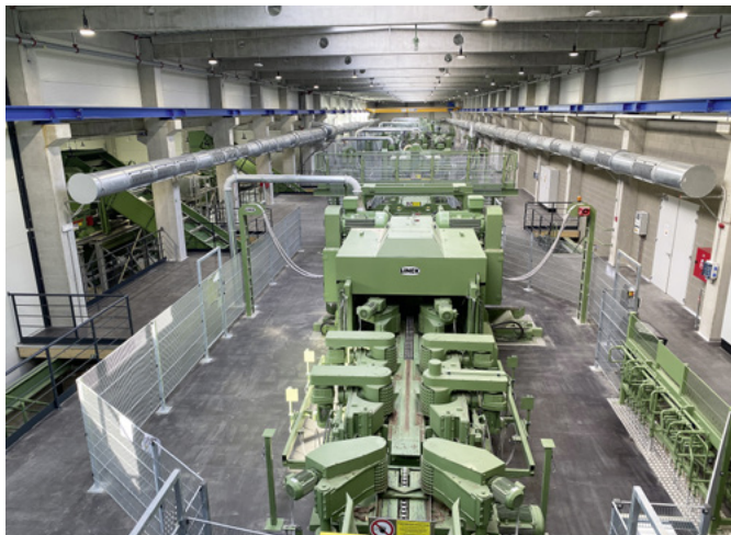
Linck line: Infeed of the primary chipper canter with a pre-centering unit and a pair of double rotating rollers for automatic turning