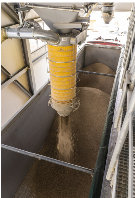
Rudnick & Enners equipped the truck loading station with a high-performance vibrating screen

At the end of May, Rudnick & Enners launched another project at Pieper Holz: This summer, an industrial wood plant will go into operation in Olsberg, to be precise a debarking and chipping line for industrial-quality softwood and hardwood logs with diameters of 10 to 60 cm. The Rudnick & Enners debarker is fed automatically by a cross conveyor and then sends the debarked logs via a power-controlled apron conveyor in the direction of the R+E chipping machine. The bark will be used in the heating plant. "This line will bring a maximum in flexibility," Isabell Pieper explains and adds: "We are very satisfied with the way the project is handled. We can tell that we are working with a family company." //